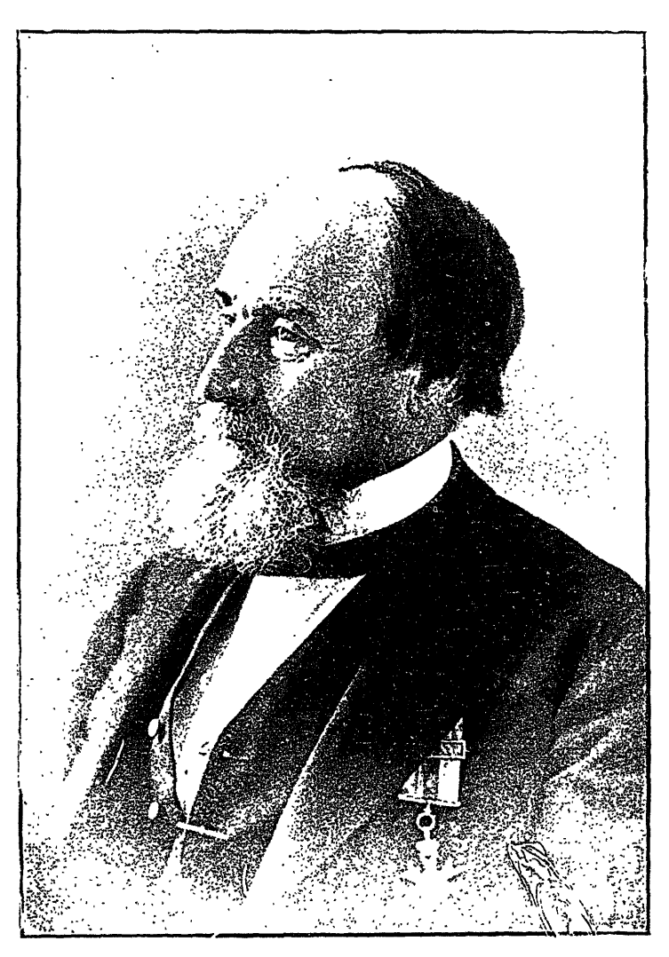
SIR WILLIAM DAWSON.