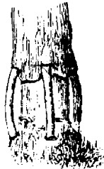
APPEARANCE WHEN COMPLETED.

hardly be necessary to say that the scions used should be living branches of a tree of the same species, and that it is advisable to insert the butt end into the bark on the lower side of the injury. They should be of such a length that they can be easily inserted by bending them a little, and when inserted be nearly straight. The sap will then flow through the bark of the twigs which have been inserted, and the circulation between the root and branches restored. When the work is completed the tree will have the appearance shewn in the following cut.