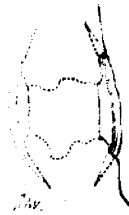
SHewing HOW THE SCIONS ARE INSERTED.

tioned to the size of the tree, and not too stiff to be somewhat elastic. These shoots are to be sharpened wedge form at each end, and openings made with a chisel in the bark above and below the girdled part. The manner of insertion is shewn in the illustration. It will