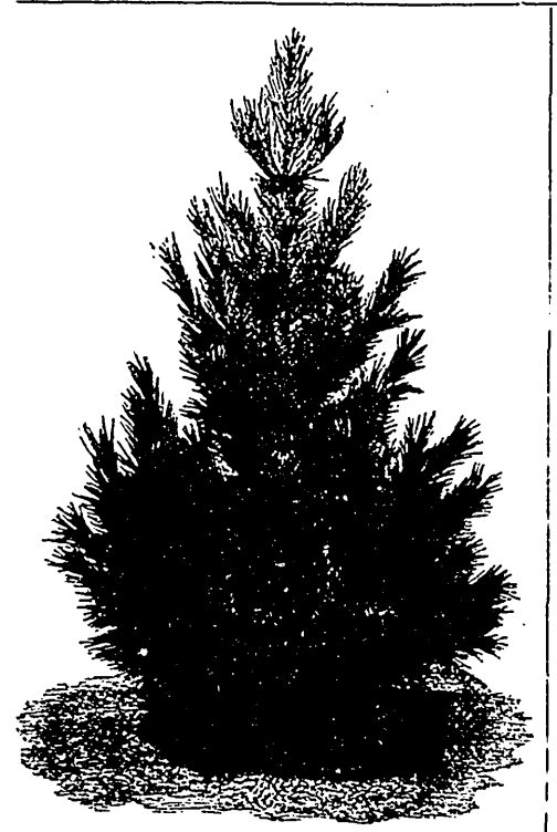
SWISS PINE (Pinus Cembra)

we have one which combines, in an unique manner, small stature with great beauty of appearance. Though in high elevations of the European Alps, where it is indigenous, it sometimes attains a height of one hundred feet, we have read of no specimens in American gardens reaching more than twenty-five feet, and that with very slow growth. The tree is pyramidal in outline, and the color is silvery green. The seed is edible, and that collected from a variety in Russia (var. Sibirica) is sold in the groceries, and much relished by the peasants.