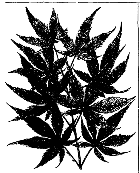
BLOOD-LEAVVED JAPAN MAPLE.

varieties. Mr. Meehan says, "There is no prettier sight than a large bed made up of the different varieties of Japanese maples. They will set off and contrast with surrounding plants better than any other class grown, having at the same time richness possessed by no other tree. Several large plants of the Blood-leaved Japan Maple, growing around Germantown attract wide attention, being the admiration of all who see them."