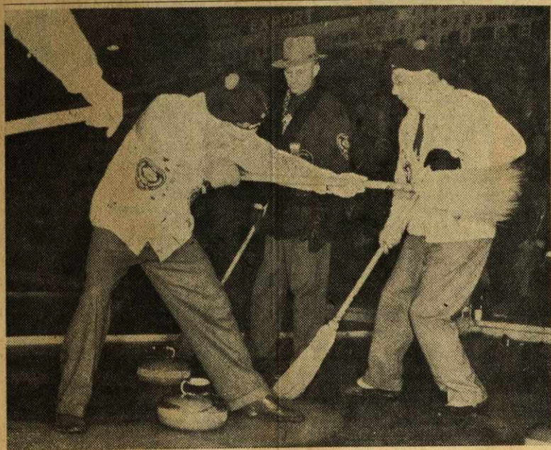
Coaxing It On. —Members of the Glooscap Curling Club of Kentville as shown above exercising all their will power to try to persuade their curling stone to stop at the right place. Needless to say it did and the Nova Scotia team went ahead to beat Manitoba and take the series 10 wins and no defeats. The skip of the Manitoba rink is standing in the background.