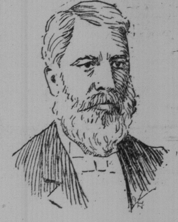
DUKE OF DEVONSHIRE. Last of Ministers to Leave Balfour

kets, the only ones showing any capacity for growth. The colonial trade done with foreign countries will be directed to our shores and will give increased employment to our workmen and capital."