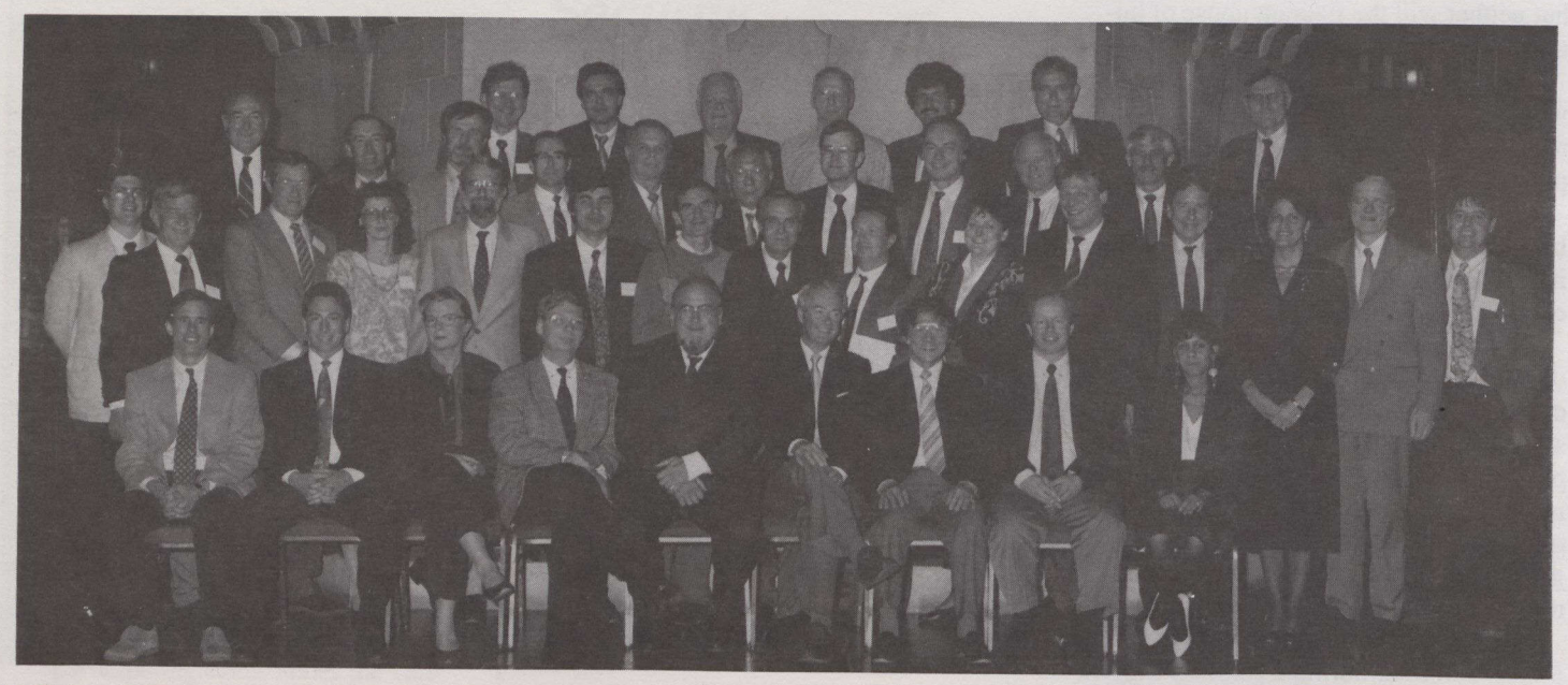
Participants in the Group of Scientific Experts November workshop at Montebello.

The Russian, French and American nuclear testing moratoria, reinforced by a US Congressional call for a comprehensive test ban (CTB) by 1996, provided fitting backdrop for a November 17 to 22 workshop sponsored by EAITC's Verification Research Program and hosted by Energy, Mines and Resources Canada. Seismic experts from 19 countries gathered at Montebello, Quebec, for the first significant discussions to focus primarily on the design and implementation of a global monitor-