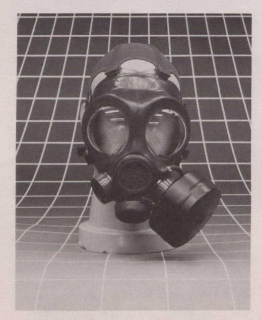
Canada is a leader in research in gas mask technology and other defences against chemical weapons.