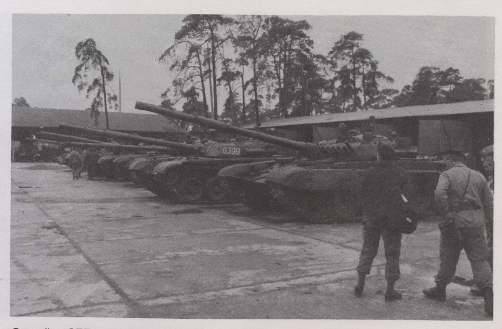
Canadian CFE inspectors in Poland in October.

The Treaty on Conventional Armed Forces in Europe (CFE) entered into force on a permanent basis on November 9, following the deposit of instruments of ratification by the last of the 29 signatories. In view of the Treaty's importance, and faced with only minor technical delays in ratification by some of the newly independent states on the territory of the former USSR, CFE States Parties had earlier agreed to a provisional entry into force effective July 17.