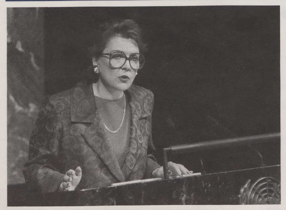
Secretary of State for External Affairs Barbara McDougall addressing the UN General Assembly in September 1992.

the social and economic agencies of this organization.