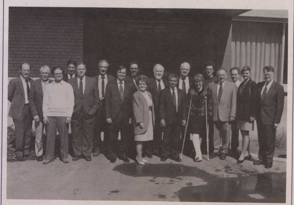
Participants at the ENMOD verification workshop in Saskatoon.

The workshop, which was sponsored by EAITC's Verification Research Program and organized by the Toxicology Research Centre of the University of Saskatchewan, was helpful in making final preparations for Canada's participation in the ENMOD Review Conference held in September.