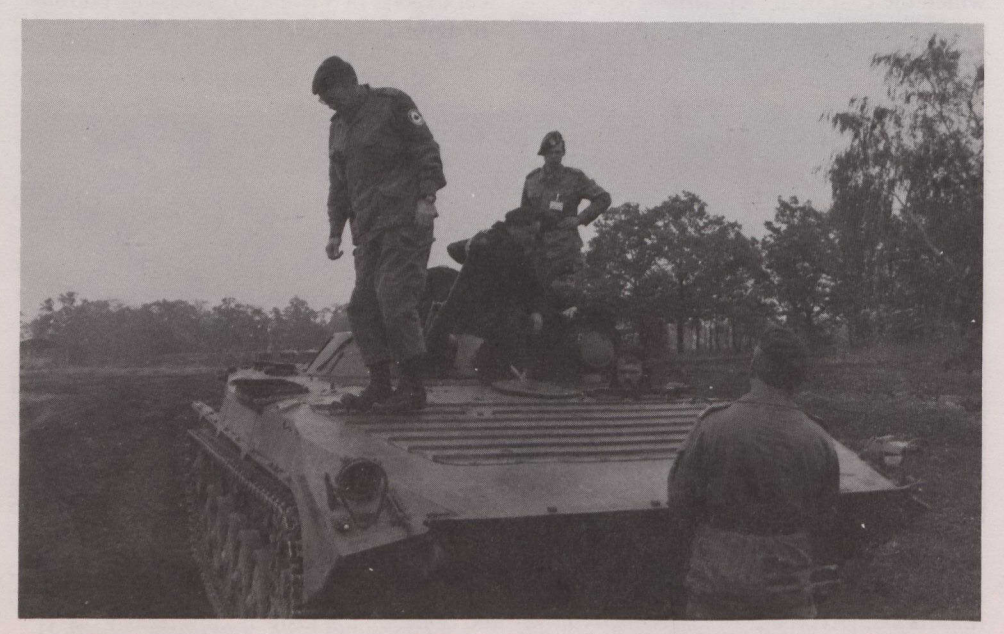
Canadian inspectors carrying out a CFE baseline inspection in Zary, Poland in October. See article on next page.

There is some useful machinery in the CSCE — the Human Dimension Mechanism and the new High Commissioner on National Minorities. We can take action without consensus and we can send missions to fact-find and to expose violations. We have to continue to strengthen the machinery and to use it effectively. Countries that are concerned about their minorities outside their borders must seek recourse through these types of mechanisms.