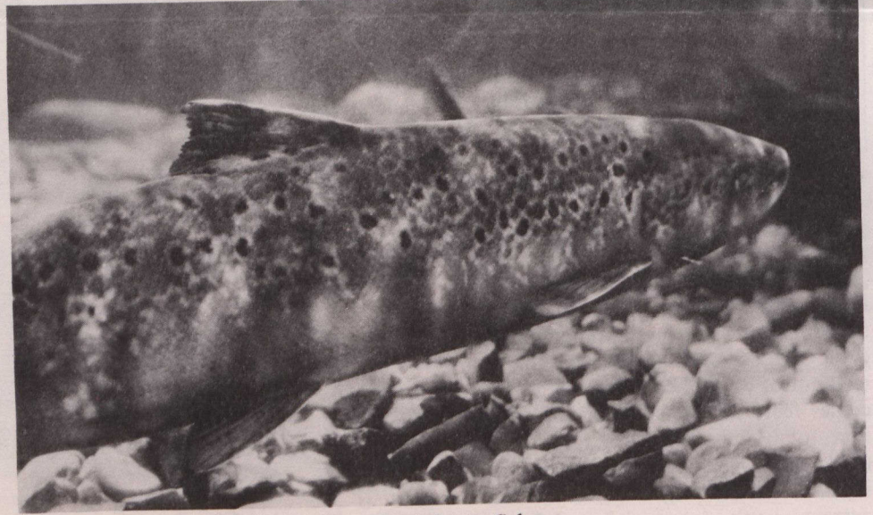
A picture taken from the NFB film, The Atlantic Salmon.

In spring, the waters come to life and the "fry" can be seen emerging from their eggs, still carrying their yolk sac. Later the salmon's distinctive markings appear on the small parr: they are now "smolts". About two years later, equipped to live in salt water, the "samlets" find their way to the sea. And two or three years later they will return to spawn in the same place where they were born.