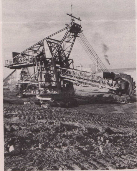
Vast reserves of synthetic crude oil are recoverable from Alberta's oil sands.

It was not until the latter half of the nineteenth century that European residents began to build permanent settlements in Alberta. The first European settlers to arrive were fur traders and missionaries. Before that, the only inhabitants were the nomadic Indian tribes, which included the Cree, the Blackfoot, the Assiniboine,