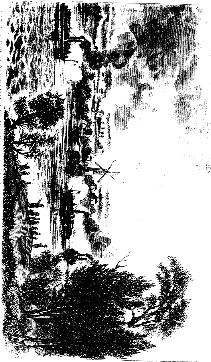
A View of the Valley of the Rhine, from the Castle of Stolzenfels, near Bonn, Prussia.