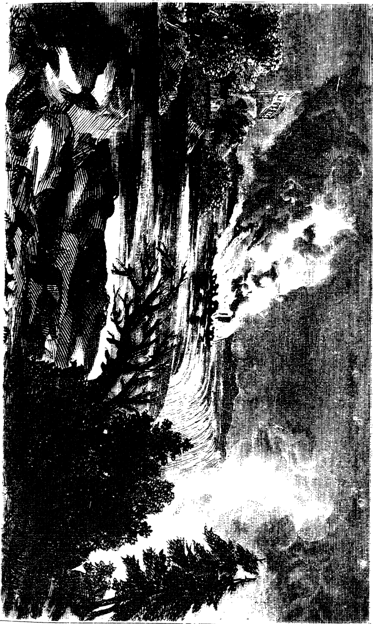
View from the Headquarters of the Inhabitants seen by the light of the burning candles