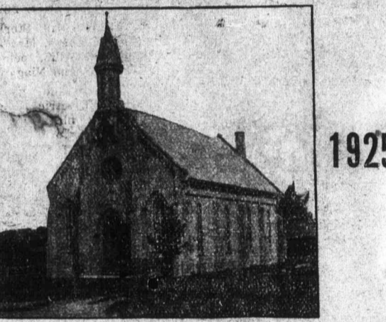
Edifice of the West Adelaide (Continuing) Presbyterian Church, (erected 1875), where Golden Jubilee Anniversary Services will be held on Sept. 6.