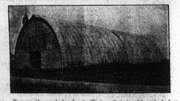
Few are the rural churches in Western Ontario with such shed accommodation as that enjoyed by the West Adelaide Presbyterians. The steel structure pictured above is so large that the whole caravan of folks who attend this church can drive right in to comfortable shelter and find ample parking space for either horse-drawn vehicle or car. And think of the many other uses to which this commodious structure can be applied—especially for tea meetings, entertainments, and all large gatherings, when the little kirk on the corner is not suitable or could not hold 'em all.