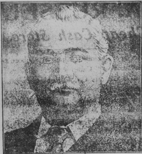
SYDNEY MINES, N. S., JANUARY 25TH 1910

"For many years I suffered torture from indigestion and dyspepsia. Two years ago, I was so bad that I vomited my food constantly. The agony I endured all these years, I cannot describe and I lost over 25 pounds in weight. I also suffered with constipation which made the stomach trouble worse. I consulted physicians, as I was afraid the disease was cancer but medicine gave only temporary relief and then the disease was as bad as ever.