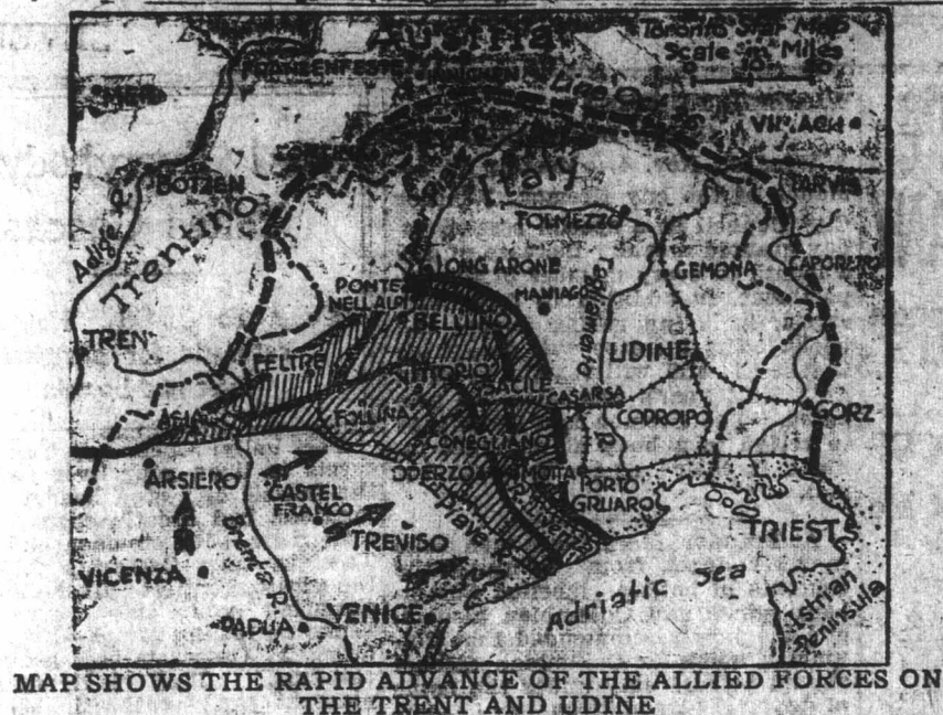
MAP SHOWS THE RAPID ADVANCE OF THE ALLIED FORCES ON THE TRENT AND UDINE