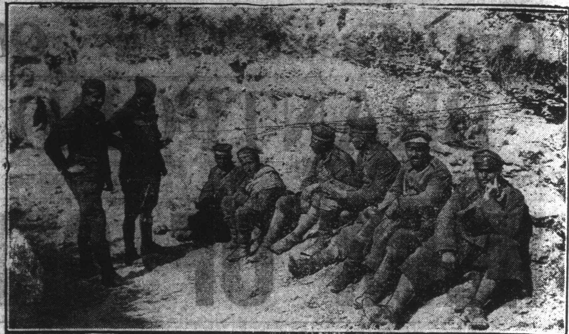
PRISONERS TALKING TO A GERMAN-SPEAKING AMERICAN OFFICER.

ELECTION IN BRITAIN By Courier Leased Wire. London, Nov. 5.—(Canadian Press Dispatch from Reuters Limited.)—General election will take place in Great Britain on December 7, it is expected. Information was given out at a meeting of whips to settle plans for the campaign.