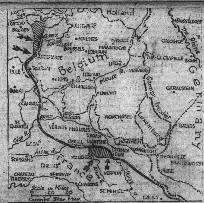
On the map appearing above, the shaded areas represent the Allied advances during Saturday and Sunday. The railway shown is one of the most important on the western front, and the one that is most menaced by the allied attacks west of the Meuse river.

Encouraging reports from all sections of the city indicate a steady improvement in the situation and confirm the general confidence that the epidemic is at last on the wane.