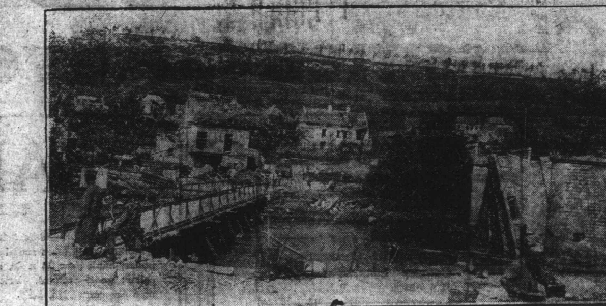
WHERE THE AMERICANS HAD TO CROSS A STREAM The Bridges at Bazoches, in France, as the first of the Pershing Forces Entered the Place.

Born of parents of frugal means and in a very early life a school teacher at a salary of $200 a year, Mrs. Sage, on the death of her husband, found herself the beneficiary of an estate of more than $50,000,000.