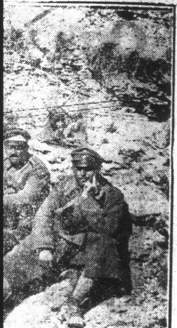
AMERICAN OFFICER. Taken in the recent battle with the...