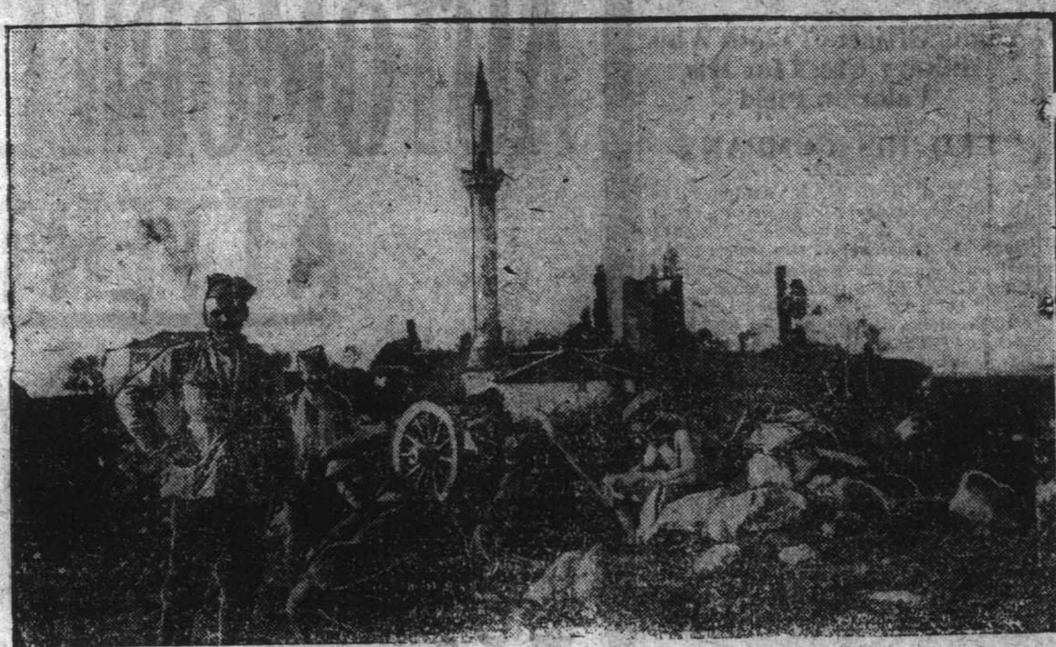
BULGARIAN PRISONERS CAPTURED BY THE SERBIANS. This Photograph was taken by a French aviator and sent to a volunteer with the French Foreign Legion and Aviation Corps.