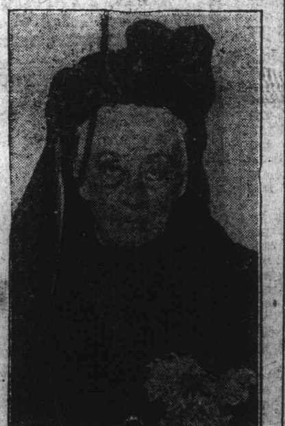
LATE MRS. RUSSELL SAGE, Widow of the great financier, and reputed to be the wealthiest woman in the world, who died Sunday at the age of 90 years.

If you WANT paper, SAVE it. If you don't save it, you DON'T NEED it. If you don't need it, some one else does. Canada needs the Money that buys it—Canada is her Victory.