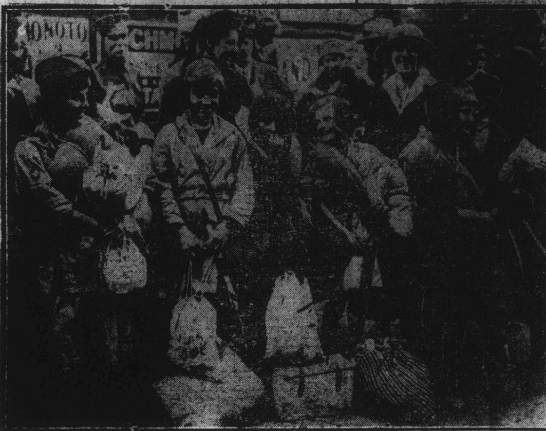
BEDRAGGLED LITTLE SERBIAN REFUGEES FIND A HAPPY HOME In this photo is shown a group of girls, members of a party of a hundred orphans, who have just arrived in London from Serbia, and who will be sent to homes in the country districts.

By Courier Leased Wire Ottawa, Nov. 4.—His Excellency, the Duke of Devonshire, attended by his aides, proceeded to the Supreme Court this morning, where His Excellency administered the oath of office to Sir Louis Davis, recently appointed chief justice of the Dominion in succession to Sir Charles Fitzpatrick, now lieutenant-governor of the Province of Quebec.