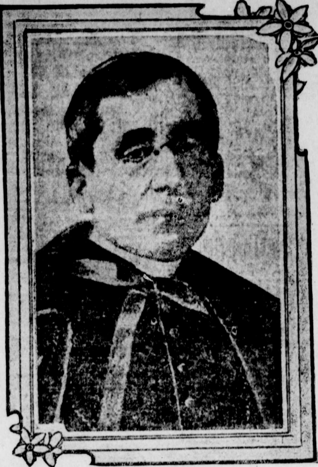
POPE BENEDICT XV., FORMERLY ARCHBISHOP DELLA CHIESA, OF BOLOGNA