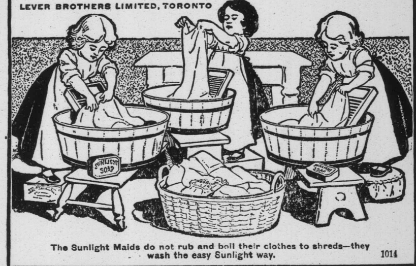
The Sunlight Maids do not rub and boil their clothes to shreds—they wash the easy Sunlight way.