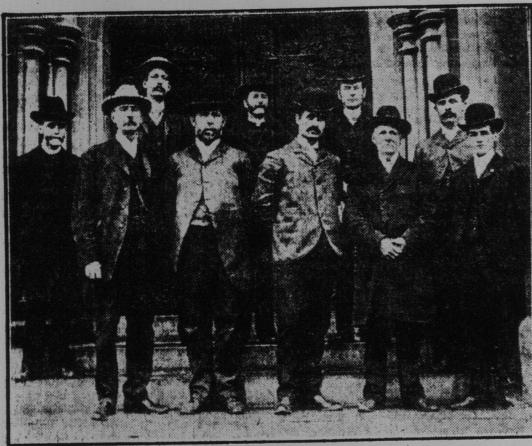
Methodist School of Missions; Some of the Workers.

Live Matters Under Consideration in Addresses at the School Yesterday—Japan and the Northwest and Opportunities for Work There—Attendance at the School Grows.