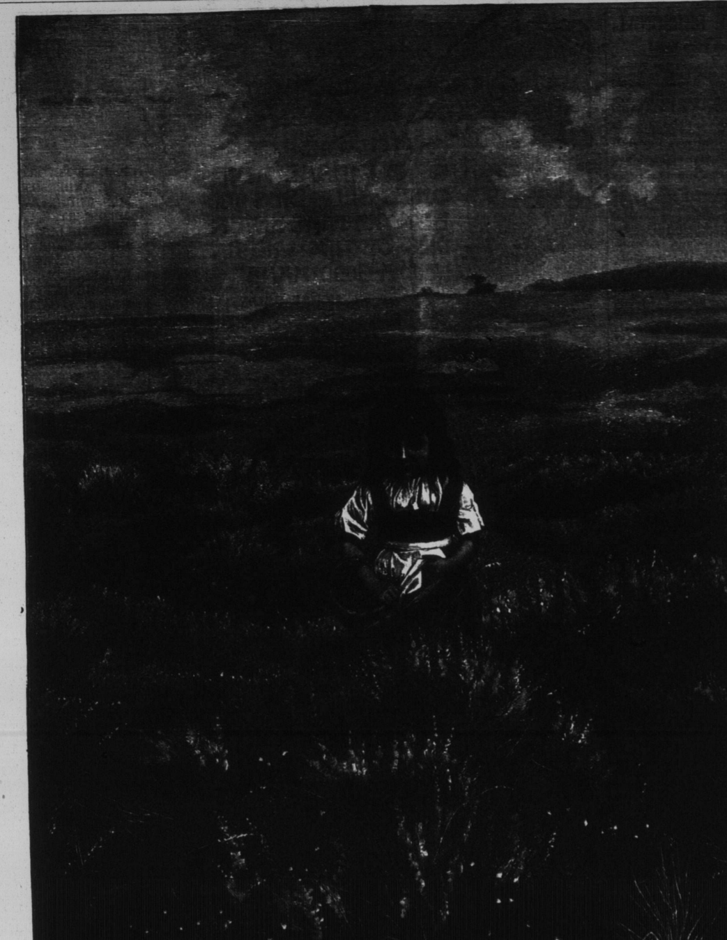
GATHERING WILD FLOWERS