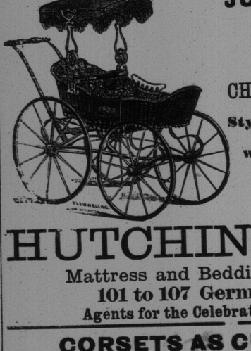
HUTCHINGS & CO. Mattress and Bedding Warerooms, 101 to 107 German Street.