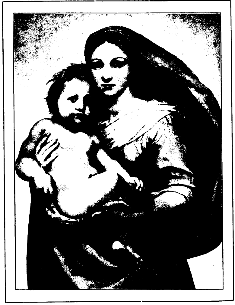
THE "SISTINE MADONNA"