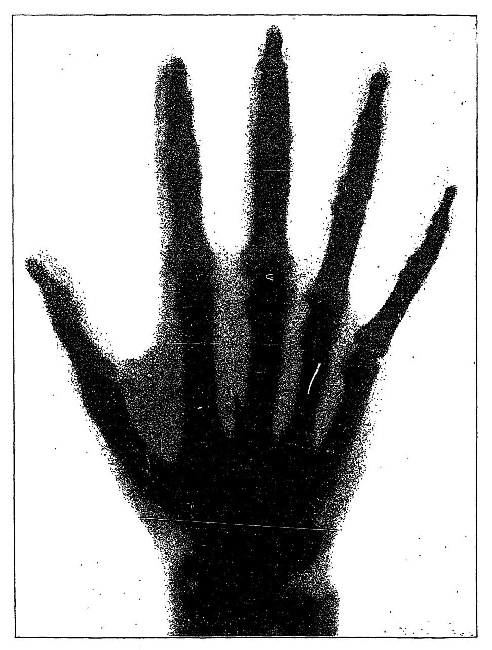
NEEDLE IN THE HAND-(See page 926.)