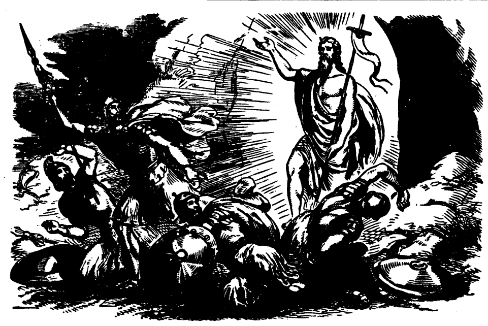
THE WATCH AT THE SEPULCHRE.