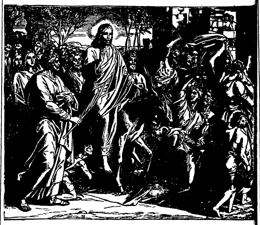
CHRIST'S ENTRY INTO JERUSALEM.

A gentleman who once lived in Germany says: "The parents of the family in which I boarded hid the Easter eggs, and the children had to hunt for them. Out in the garden, from under the gooseberry-bushes, from among the ivy-