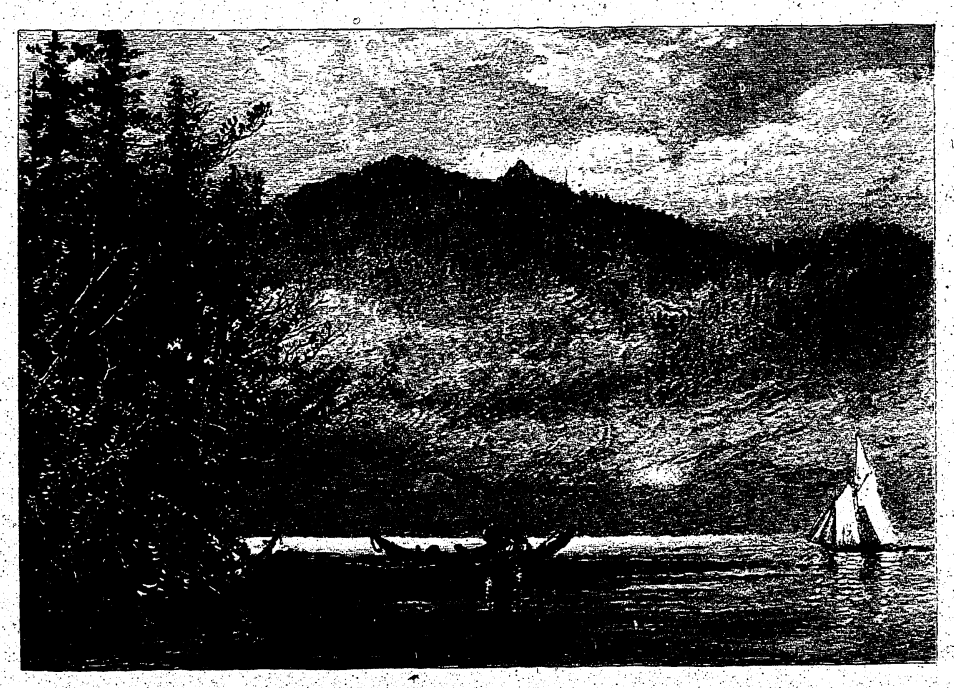
ECHO HARBOR, QUEEN CHARLOTTE ISLANDS.

which they possess, are separated by wide water stretches from the archipelago fringing the coast of the mainland of British Columbia to the north, and from the southern extremity of Alaska to the