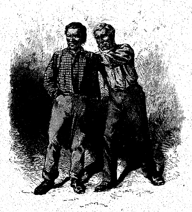
CHIEFS OF THE HAIDA INDIANS.

The halibut is found in great abundance in the vicinity of the islands, and it is more particularly on this fish that the Haidas depend. Their villages are invariably situated along the shore, often on bleak, wave-lashed parts of the coast, but always in proximity to productive halibut banks. Journeys are made in canoe along the coast. The canoes are skillfully hollowed from the great cedar-trees of the region, which, after being worked down to a certain small thickness, are steamed