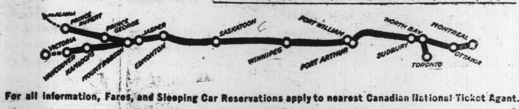
For all information, fares, and sleeping car reservations apply to nearest Canadian National Ticket Agent.