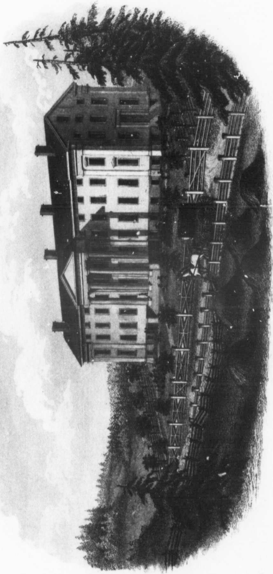
Wesleyan Academy, Mount Allison, Jackson, N.D.