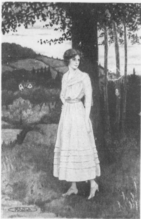
"THE HILLS AND FIELDS AND WOODS SHE HAD KNOWN AND LOVED SO LONG"—Page 26