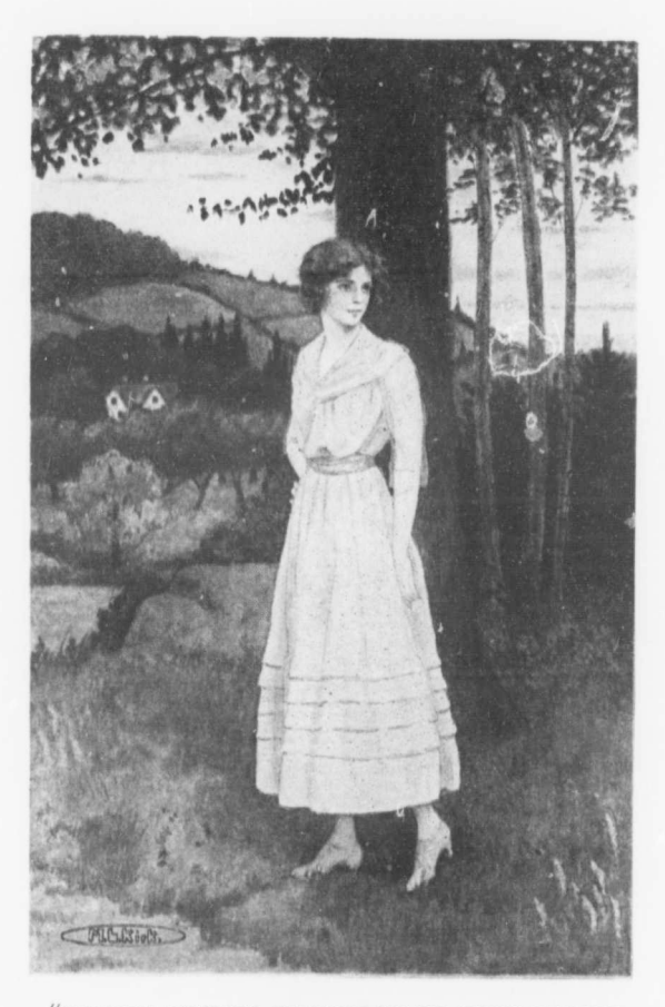
"The Hills and Fields and woods she had known and loved so long"—Page 26