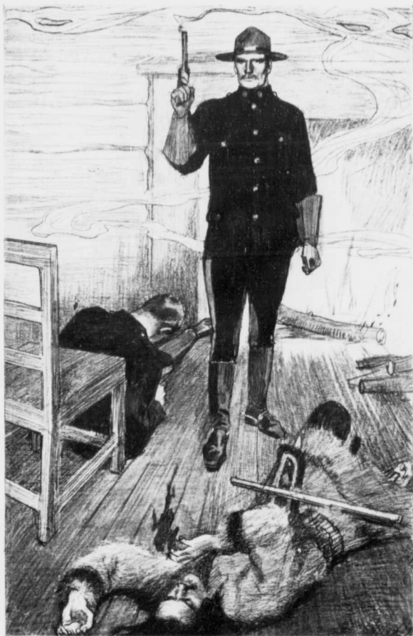
"The room was blue with smoke, but the factor saw one man standing stiffly by the fireplace, his revolver still in his hand" (see page 200).