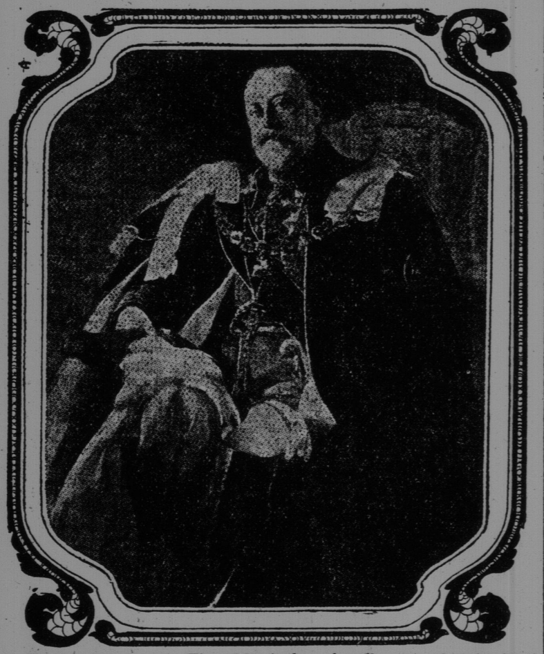
This fine portrait of the King of England was formally presented to the city of Westminster recently by Major-General Lord Chelmsford, who has been twice mayor of that place.

Under cover of the guns of the marines already there. A party of thirty men were landed from a Spanish cruiser, but this vessel did not take part in the bombardment.