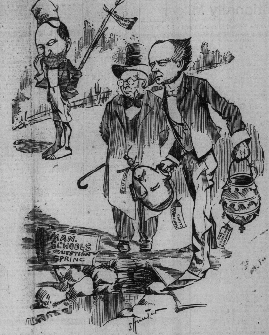
MR. LAURIER (who wishes to fill his soul and damphorn): It's taking a mighty long time to "settle." MR. OLIVER: And it won't be settled in ten years if Joseph, then, takes it into his head to stir it up again.