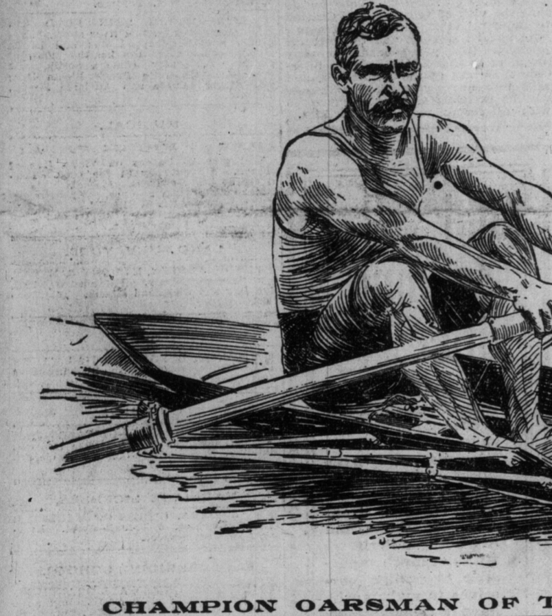
CHAMPION OARSMAN OF THE WORLD.

thousands of enthusiastic citizens. The nine miles of city streets through which he was conducted amidst inspiring music and blazing fireworks, and followed by a great string of illuminated trolley cars, and fantastically decorated bicycles, were simply thronged with men, women and children. And those who welcomed the champion were not confined to any class or classes. From the least to the greatest the people of our city joined in appreciating the presentation of a handsome purse to the champion and a series of congratulatory addresses delivered from the bandstand in Queen's Park.