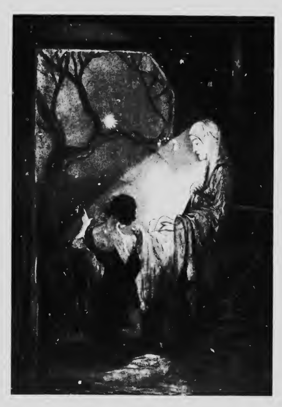
"'Draw nigh,' the woman said, 'and let His hand rest upon thee' "—Page 51