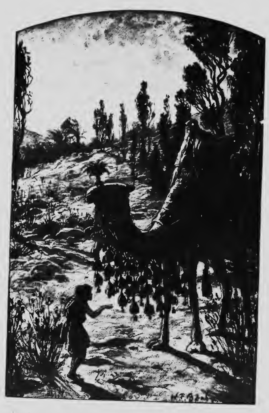
"Alms! alms!" he stammered. 'Master—Lord—I beg for—for her who keeps me'"—Page 11