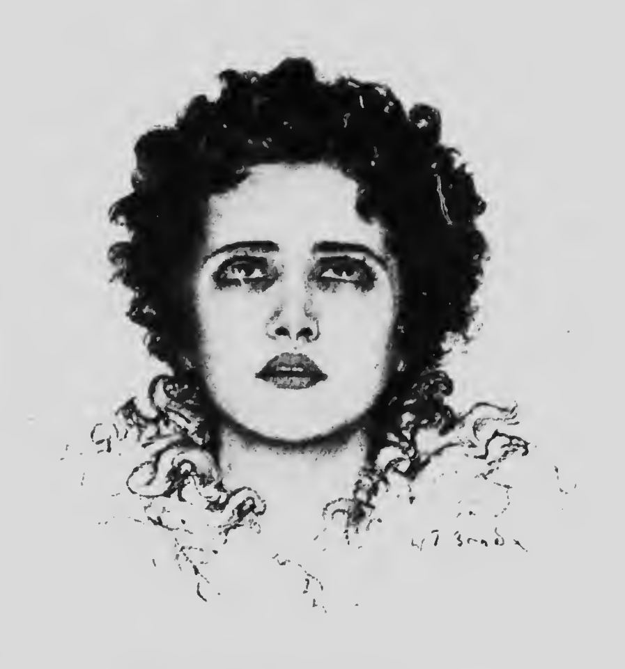
"How beautiful he is!"—Page 54