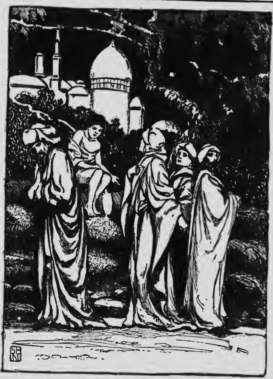
"'Perhaps when he is a man he will be a great soothsayer and reader of the stars'"