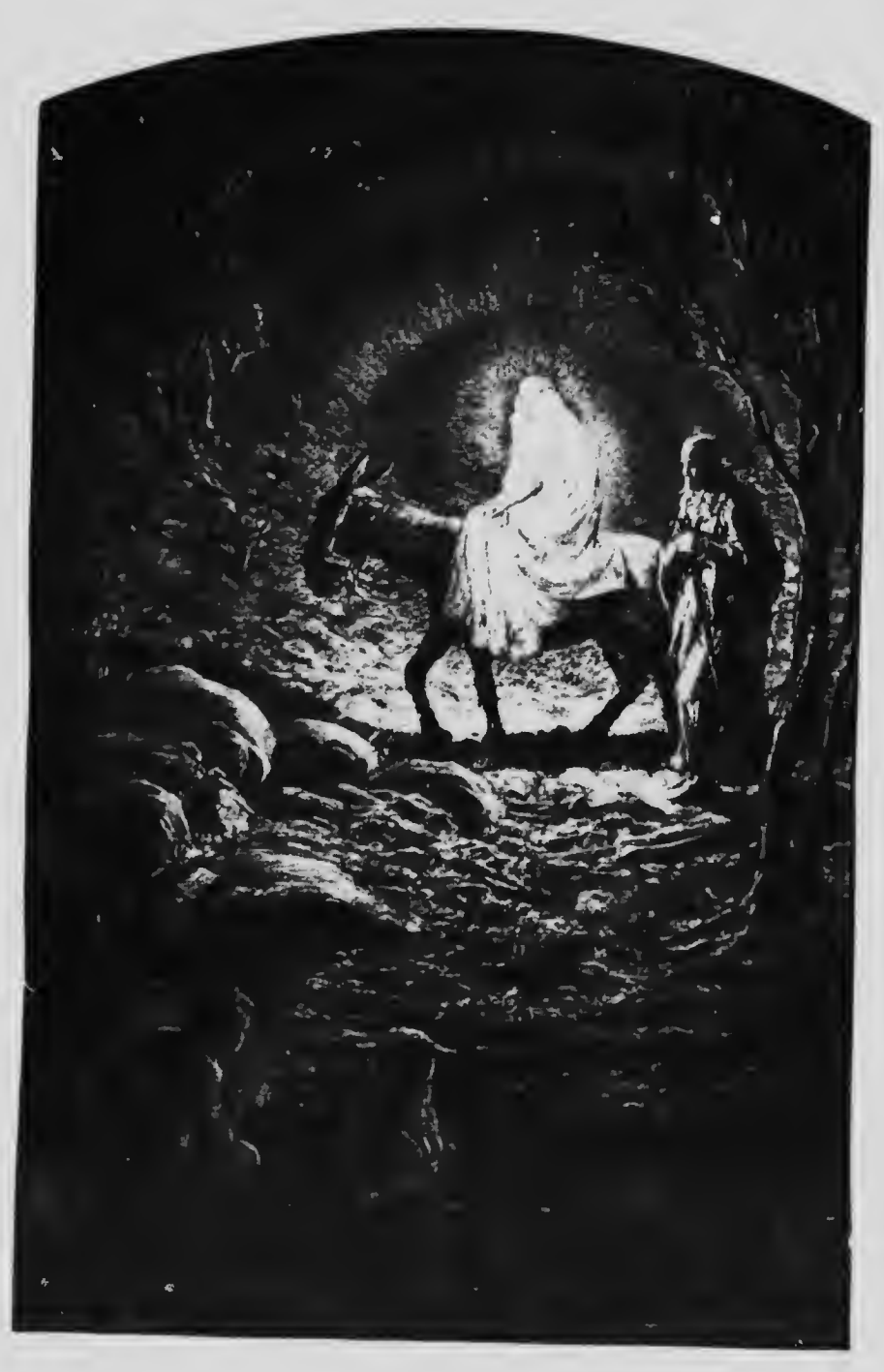
"Zia's eyes grew wide with awe and wondering as he gazed, scarce breathing"—Page 38