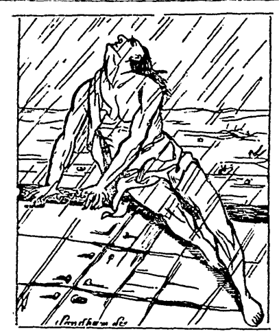
THE MAN ON TOP OF THE ARK.