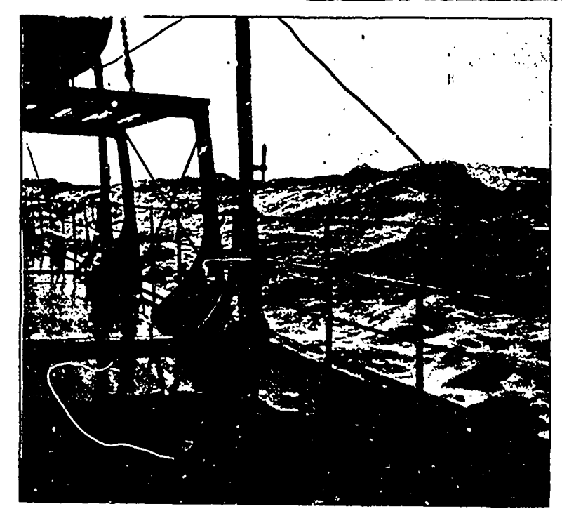
THE "LABRADOR" IN MID-OCEAN. Page 218.

Puritanism well nigh bore her down, for a time; indeed she suffered ship week, but the storm subsided. Once more the ship was manned, with the Archbishop of her ancient see of Canterbury at the helm; her breaches were restored, all damages repaired, and with sails set anew she proceeded on her way.