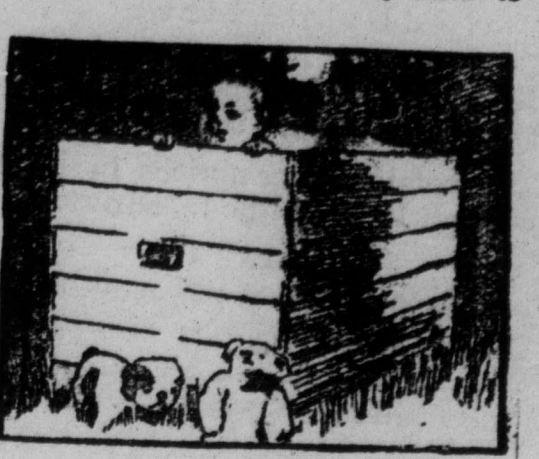
HIS SUMMER PLAYROOM

Very comfy he found it, too. Out in the orchard it was placed, and Baby was earefully lifted into it. Dolly liked to