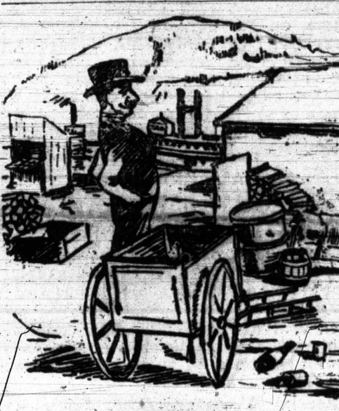
THE CLEARED WATER FRONT.

sorbed in a mathematical problem. What he claimed to make out was that if the people came fast enough to take all the water pumped the man with the long nose and whiskers would make 5 cents for every stroke of the arm which would net him $200 per minute $12,000 per hour and $144,000 per day of 12 hours. "Say, mister," said the artist, 'I'll trade you my claim on Eldorado for your well." The man with the nose and whiskers lost four strokes in order to expectorate and say, "What number? It'll have to be pretty good.'