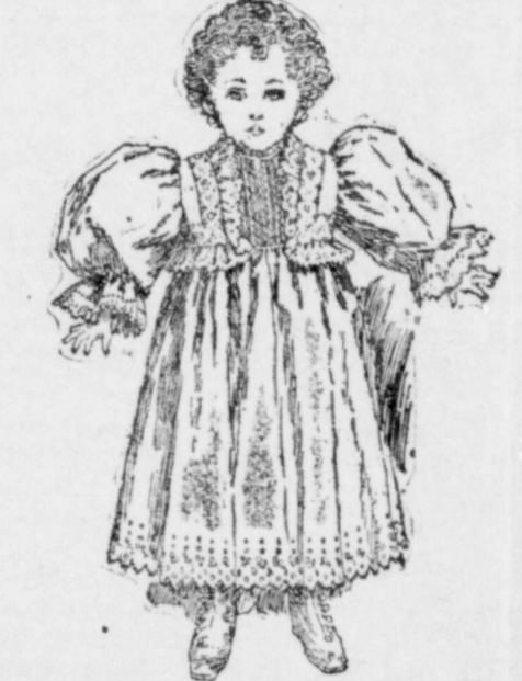
BOYS' SUMMER CLOTHING.