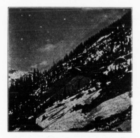
View of part of Silver Cup property, outside area affected by show-slide.

On Friday, April 15, a snowslide did serious damage at the Silver Cup mine, situate in the northeastern part of the Lardeau District. The infor-