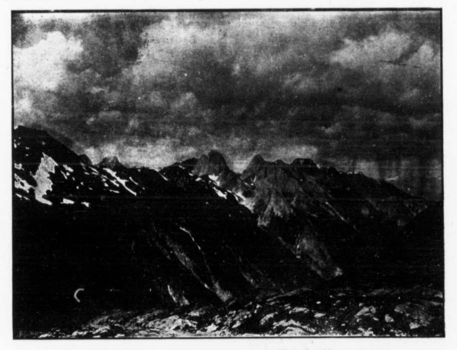
View in the Selkirk Mountains, in which range the Silver Cup Mine is situated.

THE legislation affecting the mining industry during the late session of the Legislature was not far reaching nor important. No direct legisla-