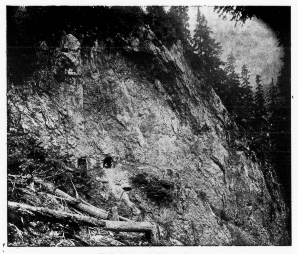
The Big Showing at the Britannia Mine.

fault creates a gap or blank in the formation, and to those are added the gaps due to vein displacement. Systematic cross-cutting, aided by diamond drilling, is necessary on account of these displacements, veinbranching, the variations of vein thickness and the shifting of ore from one set of planes to another. If carelessly placed a cross-cut or drill hole encounters so many of these blanks as to afford no information, or what is worse, indecisive results. It is very difficult to make such work efficient, and it calls for every resource of care and skill.