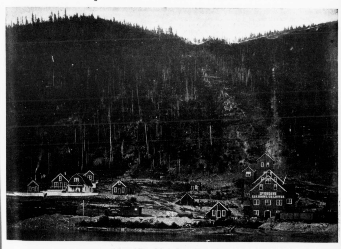
A General View of the St. Eugene Mine at Moyie.

So far as opened up the ore has occurred in three large shoots or bodies separated by barren ground. That on the St. Eugene has been developed for a length of about 400 feet and to a depth of 500 feet, and its width found to vary from three feet to twenty fect. Whilst the vein on its east and west course dups to the south at an angle of about 70 degrees, the ore shoot dips to the east. The ore is galena with