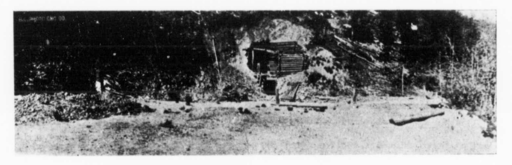
Aberdeen Claim, Ten-Mile Creek, Nicola.

"The I.X.L.ore body occupies a very wide east and west and nearly vertical fissure in the granite, the filling consisting mainly of much shattered and altered country rock and quartz. The vein, as proved by a series of open cuts across its strike, is at least 150 feet wide, but only one wall has as yet been located, and it is therefore impossible to tell the exact width. The south wall is exposed by an open cut along its strike, and is seen to consist of a reddish colored and much altered granite which, away from