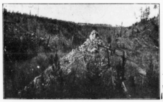
A Curious Granite Formation.

Four miles east of Mamette Lake and between Highland Valley and Ten Mile camps, extensive beds of anygdaloid are found covering a large area. These beds are in most cases nearly horizontal, with but a slight dip. Occurrences of tetrahedrite (grey copper) are met with in these beds, a few of which could be made to pay by quarrying; however, up to