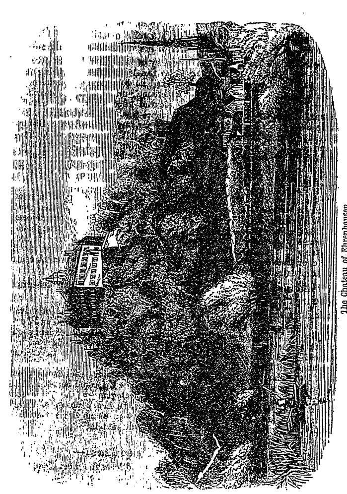
The Chateau of Eprenhausen.