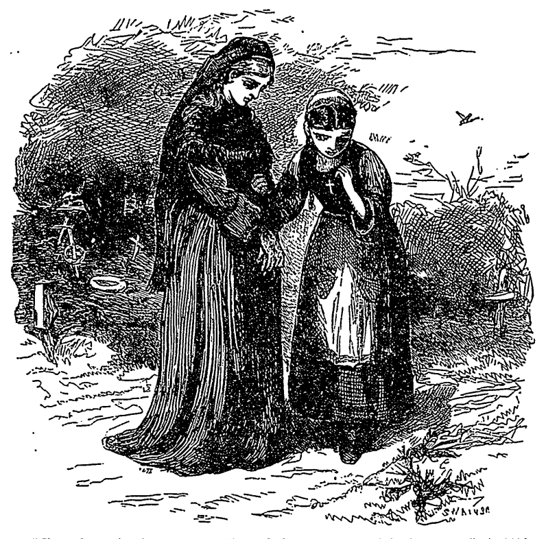
"She spoke, gazing down upon the Marigold plant at the foot of the two graves."-(p. 246.)

"SANOTHER day passed; and little Marie was there again in the burial-place. 'God's Acre,' the Germans call it, and the words carry with them a beautiful and