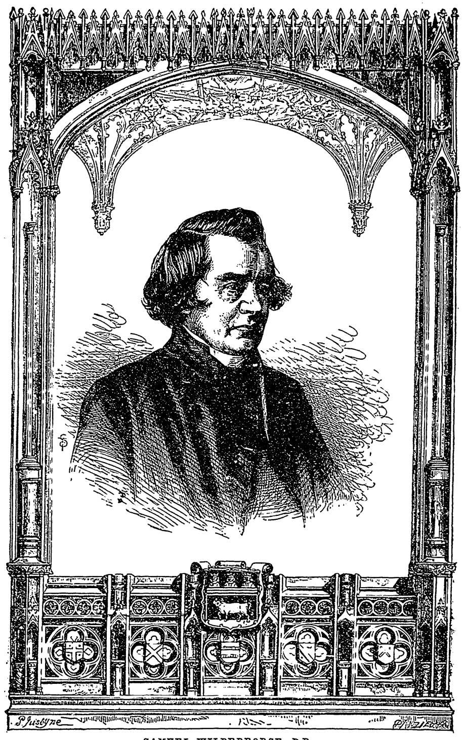
SAMUEL WILBERFORCE, D.D. Bishop of Oxford, 1845; Bishop of Winchester, 1869.