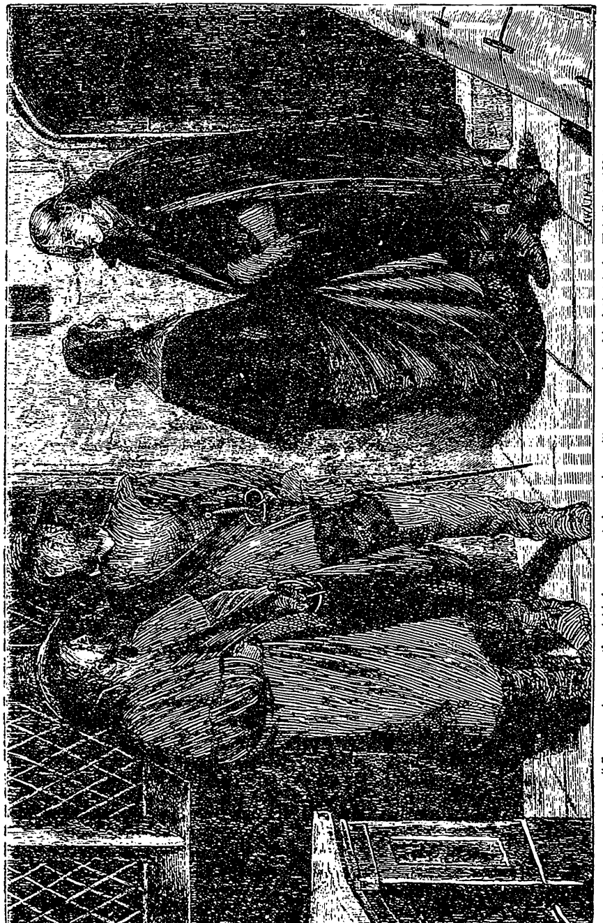
" For my siko you will to life let your istar's matricka with my very true friedd (dristoj hat Vake?"—(p. 233)