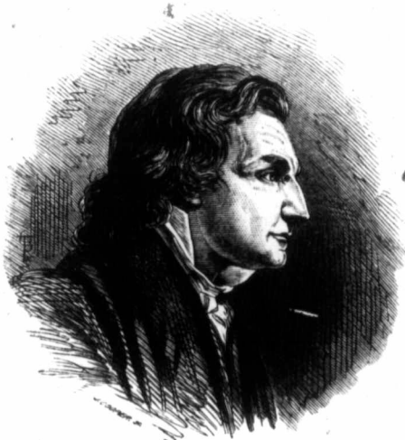
AUDUBON AT GREEN BANK, LIVERPOOL. ( From a drawing by himself. ) Sept. 1826.

LONDON: SAMPSON LOW, SON, & MARSTON, CROWN BUILDINGS, 188, FLEET STREET.