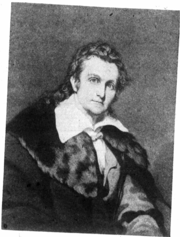
JOHN J. AUDUBON.

London: Sampson Low, Son, and Marston, Ludgate Hill.