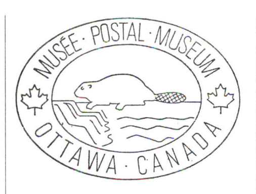
Special Postal Museum cancellation

A sales counter, completely decorated to resemble a turn-of-the-century post office operating out of a general store, will also be located in the museum.