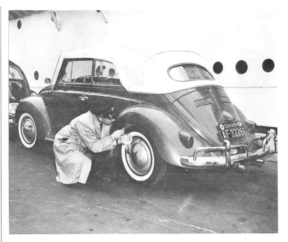
An inspector from Agriculture Canada takes a soil sample from an imported

"It's the traveller's choice. If he wants to bring a vehicle into Canada by boat, we leave it up to him to meet