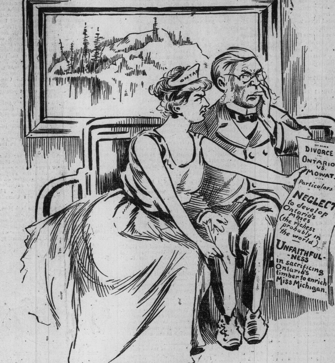
ONTARIO: These are two of many serious charges against you, Sir. We separate on the 26th; make no mistake about it.