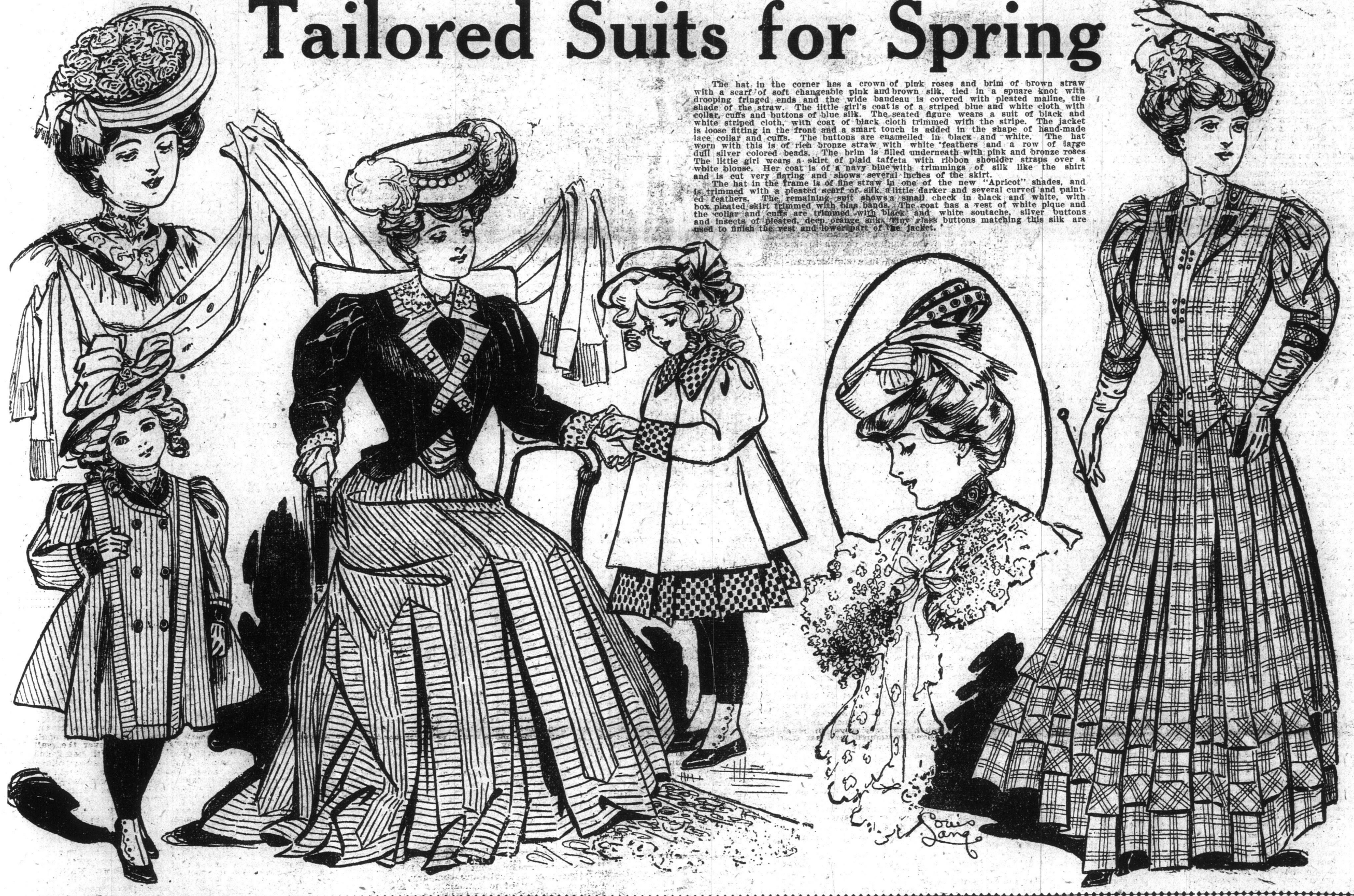
The hat in the corner has a crown of pink roses and brim of brown straw with a scarf of soft changeable pink and brown silk, tied in a square knot with drooping fringed ends and the wide band is covered with pleated mulline, the shade of the straw. The little girl's hat is a striped blue and white cloth with a scarf of pink and white silk. The seated figure wears a suit of black and white striped cloth, with coat of black cloth trimmed with the stripes. The jacket is loose fitting in the front and a smart touch is added in the shape of hand-made lace collar and cuffs. The buttons are enameled in black and white. The hat is worn with this is of rich bronze straw with white feathers and a row of large dull silver colored beads. The brim is lined underneath with pink and bronze roses. The little girl wears a suit of plaid taffeta with ribbon shoulder straps over a white blouse. Her coat is of a navy blue with trimmings of silk like the shirt and is cut very flaring and shows wide neck. The hat in the frame is of the new "Apricot" shades, and is trimmed with a pleated scarf of silk, a little darker and several curved and painted feathers. The remaining suit shows a small check in black and white, with box pleated skirt trimmed with blue bands. The coat has a vest of white plique and the collar and cuffs are trimmed with black and white soutache. Silver buttons and insects of pleated, deep orange silk, give these buttons matching this silk are used to finish the vest and lapel-edges of the jacket.

DOYLE would give the firmer, for so he would there were the shrines of the saints, each with a relic in the center, and around stacks of deserted crutches and votive hearts to prove them. Very turn he would, and how easily thin was the veil, and how easily which screamed him from the densens of the casen world, the announcement of the fated monk seemed to the an incredible to those whom the. The Abbot's ruddy face for a moment, it is true, but he the crucifix from his desk and valiantly to his feet.