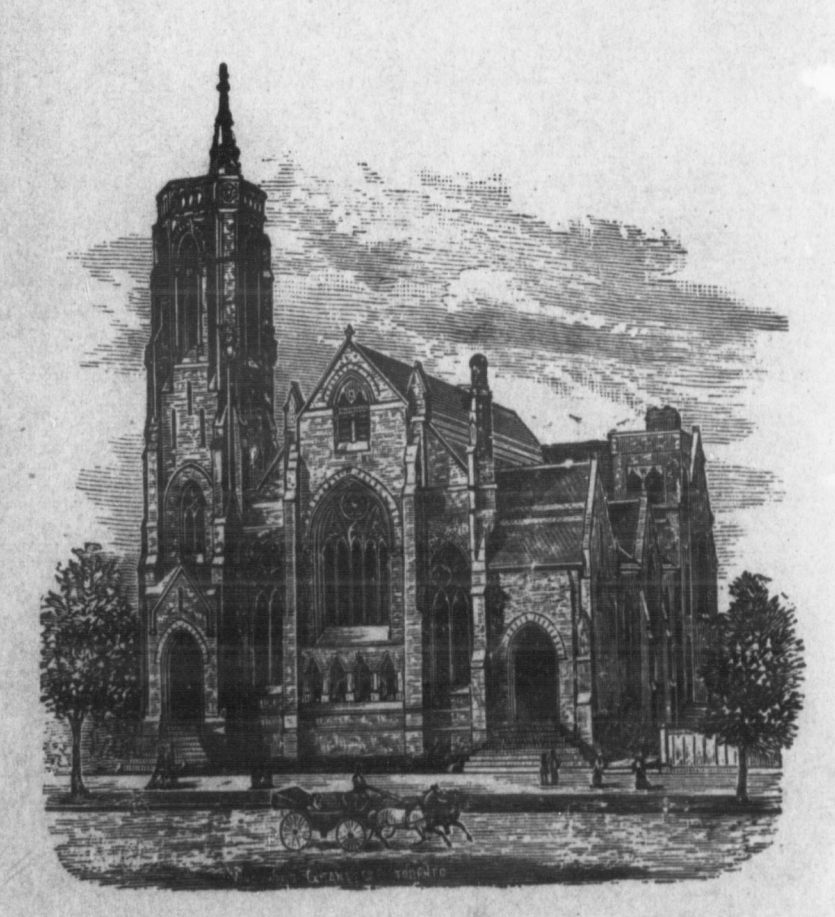
ST. JAMES SQUARE PRESBYTERIAN CHURCH, TORON TO.