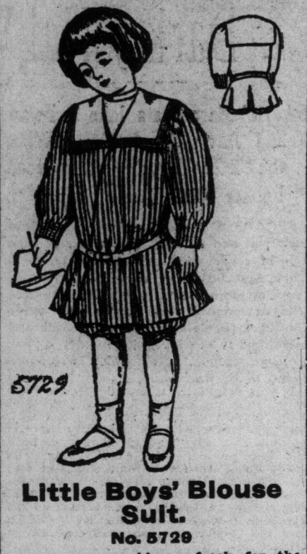
Little Boys' Blouse Suit No. 5729

A picturesque blouse frock for the little man in here shown. The front closes diagonally and is secured at the waist with a leather belt. A large collar gives jauntiness to the costume. A shield with narrow standing collar finishes the neck. Little bloomers are worn underneath the dress and are included in the pattern, which will be mailed to any address on receipt of ten cents in silver. The pattern here illustrated will be mailed to any address on receipt of ten cents in silver.