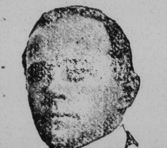
CAPT. R. F. SCOTT

(Publishers Press News Service) London. — Did either Capt. Scott or Capt. Amundsen reach the South Pole on Xmas day in the principal topic in London at the present moment.