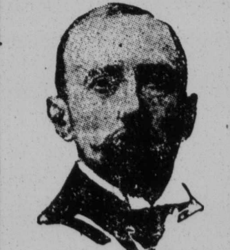
CAPT. ROALD AMUNDSEN

straight south through Ross sea to McMurdo sound, near which he established his winter quarters last May.