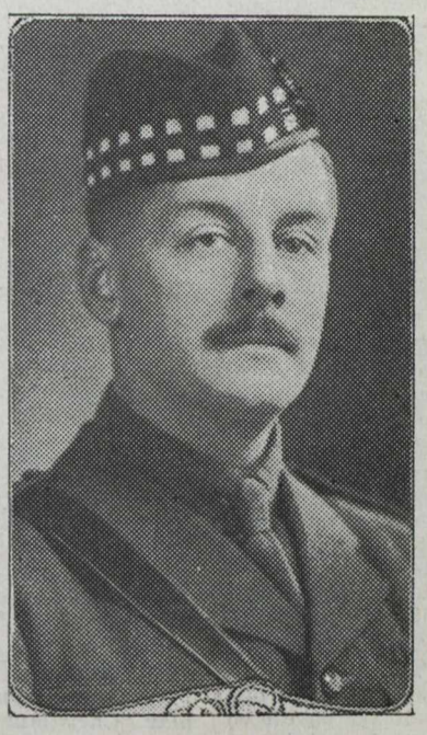
No. 4 Company