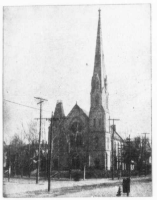
FLETCHER AVE. M.E. CHURCH, INDIANAPOLIS.

NDIANAPOLIS is a typical American city—beautiful, cleanly, enterprising, easy of access, population homogeneous-mostly Protestant. There is a stalwartness, stright-forwardness, frankness, characteristic of Hoosierdom. Though only 200,000, or close to that, in population, its situation is so central, and the agricultural conditions so fortunate that the increase in population is steady and substantial. Chicago to the northward, Cincinnati to the eastward, Louisville to the southward, and St. Louis to the westward, are sufficiently distant to make this a thrifty trading point; and being the capital city of Indiana, which, like a sandwich, lies between the great, rich States of Ohio and Illinois with their millions of population, residence here for commercial and wholesale men is very desirable. This immediate Central West was captured for Methodism in the early