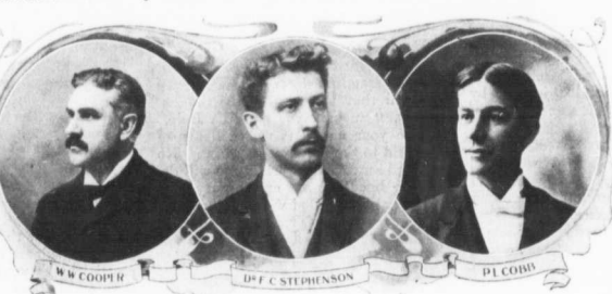
LEADERS OF THE FORWARD MOVEMENT FOR MISSIONS

tional and interdenominational young people's movements.