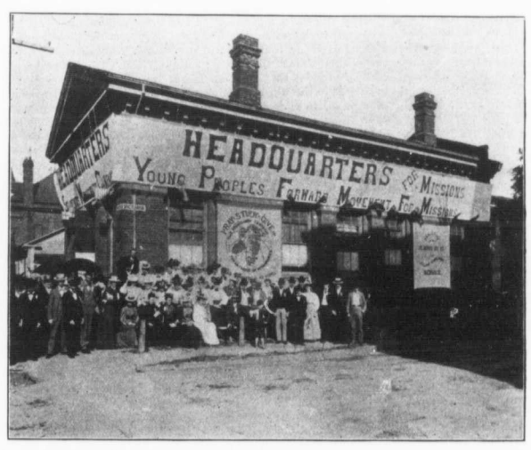
MISSIONARY WORKERS AT THE TORONTO INTERNATIONAL CONVENTION

Norwich District is alive to missions. The district officers are organizing the missionary department throughout the district and have faith to believe they will soon have a missionary of their own