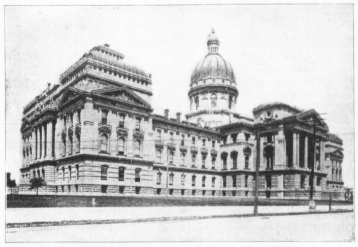
THE STATE HOUSE, INDIANAPOLIS CONVENTION HEADQUARTERS.

HAT do you say to this question. leaguer! Have you asked this of yourself! If not, let us ask and answer it together. Of course if it is at all within the range of possibilities you will be here. You don't want to be lone-ome by staying at home. This great gathering of the younger forces of Methodism is being discussed in all the states of the Union, and is being advertised and exploited as perhaps none of the other great International League Conventions have been. It will be the largest gathering of Methodists this world has ever seen. Think of that! Can you afford to miss the opportunity of being on the ground! For those who attend it will prove a source of great inspiration. This is one of its chief