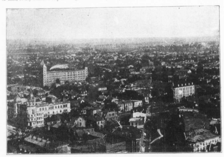
BIRD'S-EYE VIEW OF INDIANAPOLIS, NORTH-WEST FROM MONUMENT.

Another block and a half east is Tomlinson Hall, owned by the city, and capable of holding about 4,000 persons, the ground floor being used for market purposes. Fronting this hall is the Marion County Court House, which cost about $1,750,000. Its numerious spacious rooms are also at the disposal of the con-