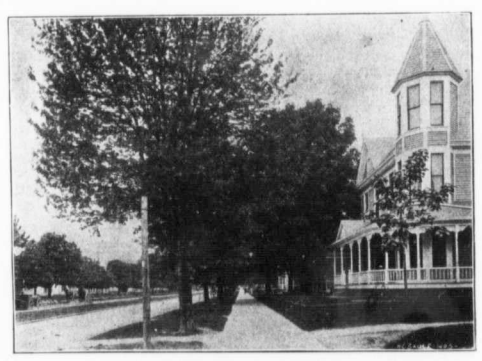
FLETCHER AVE., INDIANAPOLIS

We need your brains in all discussions, but we desire also that your social charms and religious fervor shall be in evidence at every turn. With the blending of the national flags let there be a fraternization of the peoples. To that end, is it too much to ask that the attend-