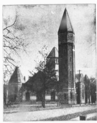
CENTRAL AVE. M.E. CHURCH, INDIANAPOLIS.

German Methodists are doing strong work for Christ. The colored Methodists are enthusiastic and enterprising. The ministerial talent was never better than now. There are 2,000 Senior Epworthians in our own M. E. churches, and about 1,000 Junior. Some