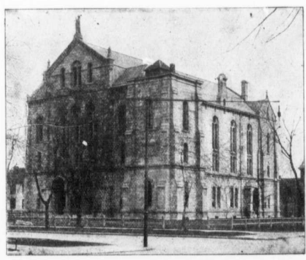
ROBERT'S PARK M.E. CHURCH, INDIANAPOLIS

The coming International Conference of the Epworth Leagues of Canada and the United States promises to be, in many important particulars, the most enthusiastic and interesting assembly of young people ever held. The Epworth League has now advanced to a point of large development and enduring strength. It has ramified every department of church life. The social instincts of young Methodits have been touched and sanc-