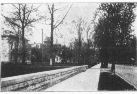
NORTH MERIDIAN ST. INDIANAPOLIS

great help in practical methods of work. Come with clear conceptions of how the work should be done, if you know. you have any copyright plan that has worked wonders, solved difficulties, or made the gospel machinery go, bring it along. Uncan your wisdom and give others the benefit of your experience. Whatever you do, don't come with long speeches. There is a suspicion hereabouts that an immense gong, with huge powers will be concealed somewhere in each of the places of assembly to "ring off" those who shall set their mouths to going and then go off and let them "run on." gong arrangement may seem cruel, but you know how necessary it seems when others talk.