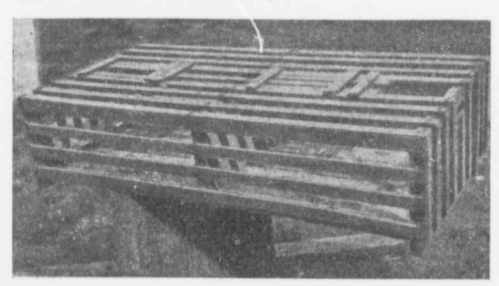
A suitable crate for shipping fowls alive.

Ordinary market crates after the following picture are always useful when one is culling fowls or moving them from pen to pen.