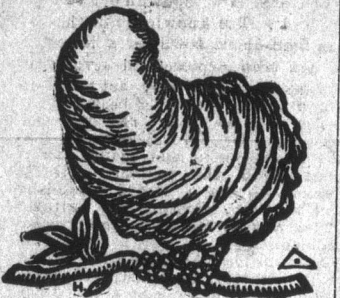
The bivalve is a funny bird. For silence he's renowned.

At the recent dinner of the Associated Press in New York the quaint menu was in the form of a tiny book, with a cut like those reproduced here, illustrating every item in the feast.