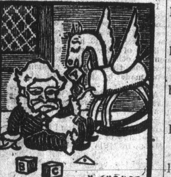
His hobby was a hobbyhorse With wings of driven snow.

When Mark Twain arose to make his humorous remarks about phonetic spelling, the diners, turning to page 13 of the menu, found there this picture and verse dealing with the gentle humorist: