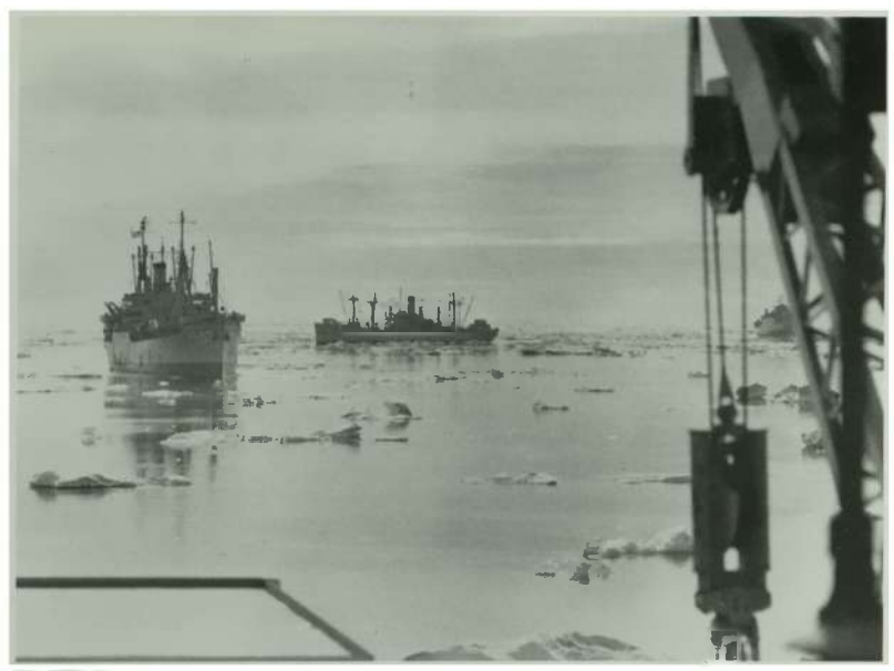
PA-108144 Supply convoy en route from Coral Harbour to Dew Line Site No. 30, North West Territories, 16 August 1955.

Convoi de ravitaillement se rendant à la station nº 30 du réseau d'alerte avancé, depuis Coral Harbour dans les Territoires du Nord-Ouest, le 16 août 1955.