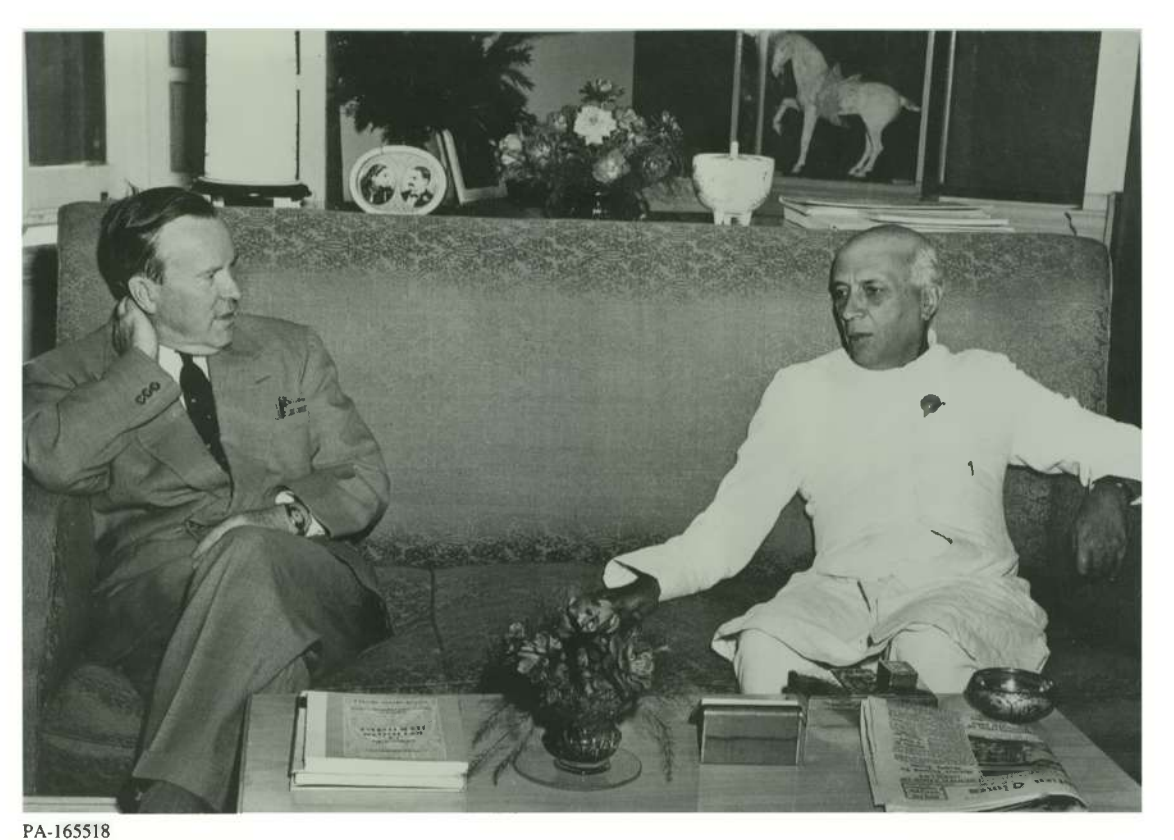
L.B. Pearson visits with Prime Minister Jawaharlal Nehru of India, 4 November 1955.