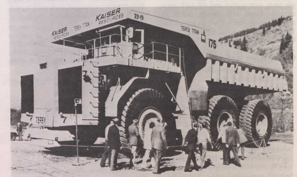
Said to be the biggest truck in the world, this six-wheeler will be put to use at Kaiser Resources Ltd.'s coal-mining operations in southeastern British Columbia. The truck, which was manufactured in London, Ontario and assembled in B.C., will weigh 600 tons fully loaded. When dumping, it is the height of a six-storey building.