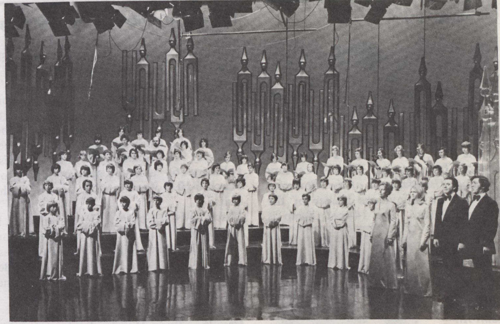
Les Petits Chanteurs, seen in concert (above), have made eight recordings.

Les Petits Chanteurs have given several live concerts, and radio and television broadcasts across Canada and abroad. In 1967, they participated in the "Christmas of the World" performance held in Orly, France. Les Petits Chanteurs have also entertained audiences in New York City, Springfield, Mass. and Uttica, N.Y.