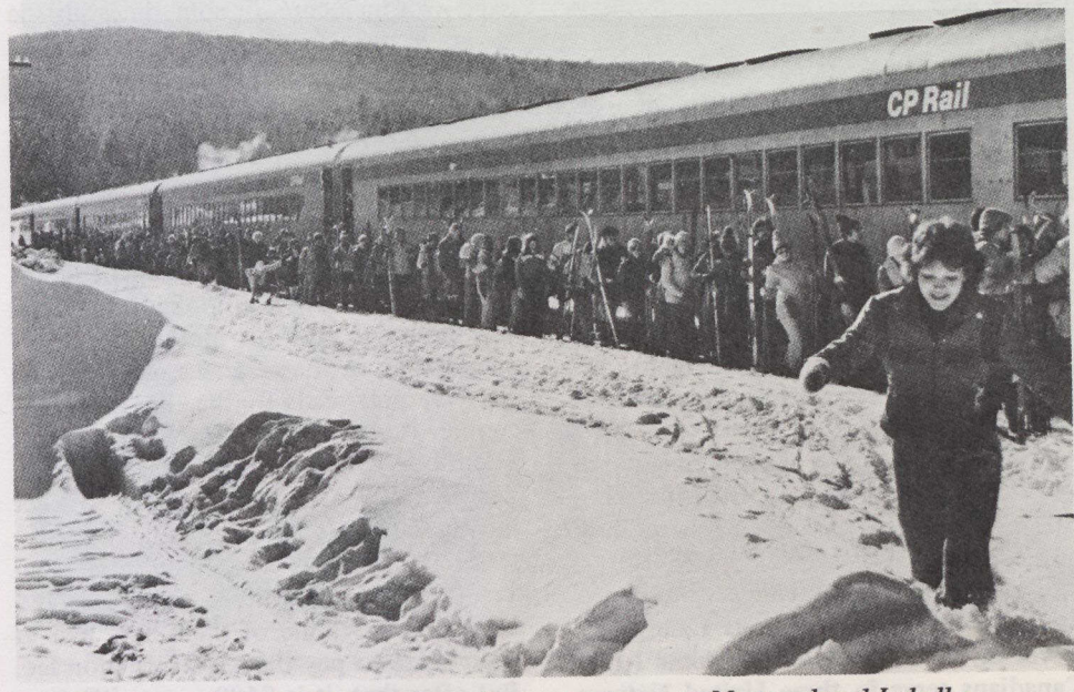
"Le P'tit train du Nord" provides regular service between Montreal and Labelle.

The Laurentian ski train returns to the rails this winter. Called "Le P'tit Train du Nord", it ran for eight Sundays and carried over 1,000 people per trip last year. Encouraged by the turnout, the organizers - the Laurentian Tourist Association and the Laurentian Regional Development Council - have added a Saturday train.