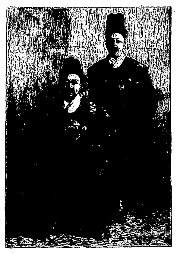
THE KING OF COREA AND HIS SON.