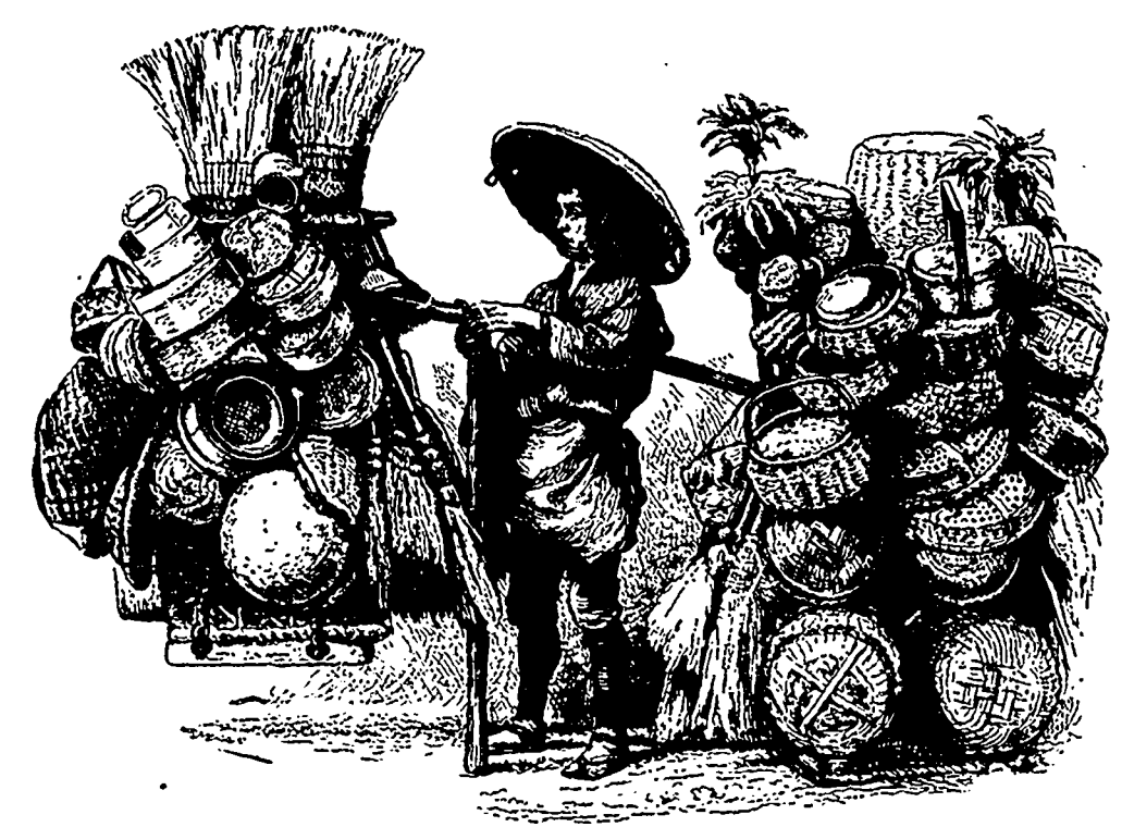
JAPANESE BASKET MAKERS.