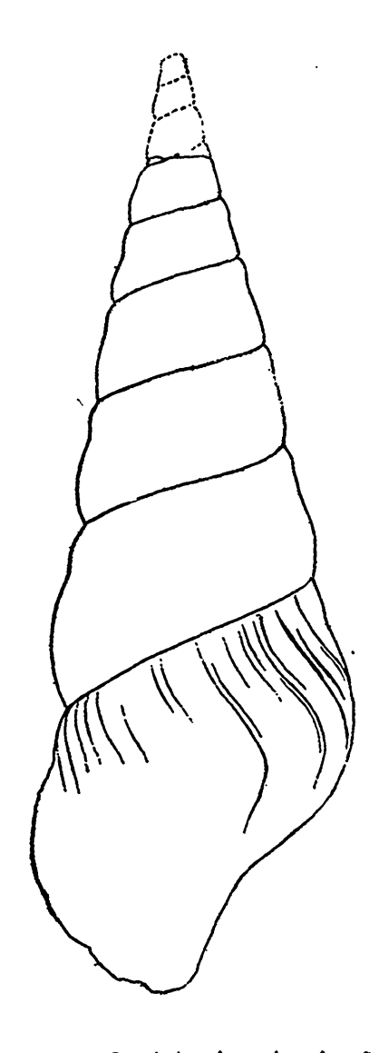
Lozonema Winnipegense.—Dorsal view of a specimen from Stony Point, Lake Winnipeg, in outline only, and of the natural size.